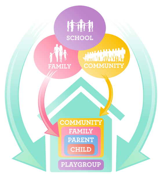
Figure 2: The parallels between Epstein's and the Playgroup model

The Playgroup Model, like Epstein's overlapping spheres of influence model, includes the family and community, but also draws specific attention to the child and the parent. The model highlights the important role playgroup plays as a foundation for child development. The Centre for Community Child Health has described community playgroups as a three pronged approach; nurturing children, supporting families, and building communities. This sets community playgroups apart from other groups or services.