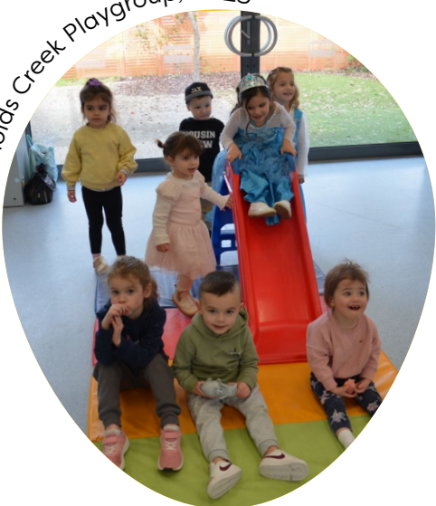
Arnolds Creek Playgroup, 2023