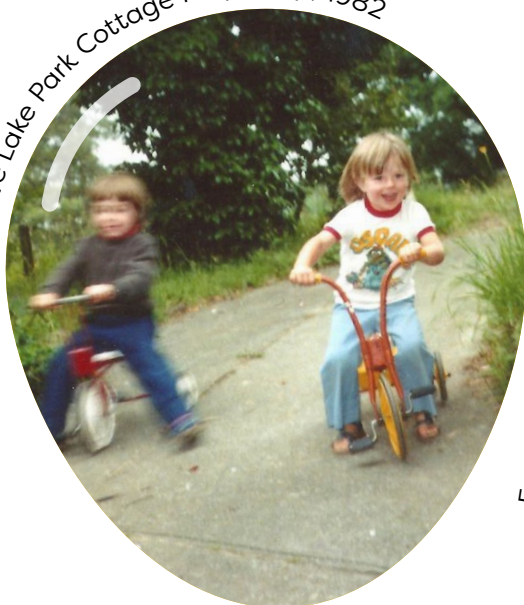
Belgrave Lake Park Cottage Playgroup, 1982