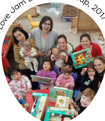
Fam Love Jam Band Playgroup, 2017