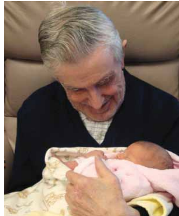
Starting playgroups in aged care facilities

Information on playgroup comes from Playgroup Victoria learnings gained over the last 36 years.